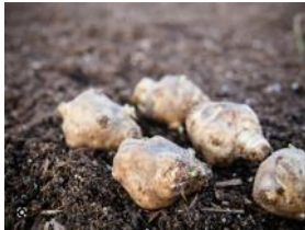
Jerusalem Artichoke Tubers

This plant is typically grown in the spring (zones 3 to 8) from tubers found at garden centers or online.