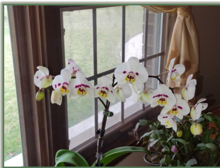
Dee's favorite orchid Phalaenopsis (moth orchid)