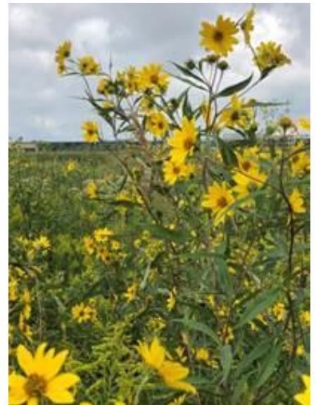
Photo taken at the Air Station Prairie in Glenview

This beautiful native plant is also called sunroot, sunchoke, or wild sunflower and is a species of the sunflower. It is native to central North America and it is widely cultivated for its tuber, which is used as a root vegetable. The tubers have a nutty flavor and are eaten raw, cooked, or baked. The Jerusalem Artichoke grows 4 to 10 feet in height and blooms in the late summer and fall. The daisy-like yellow flowers have yellow, brownish, or purplish disk flower centers. If you sniff the center of the flower it actually smells like chocolate which helps distinguish it from other sunflowers!